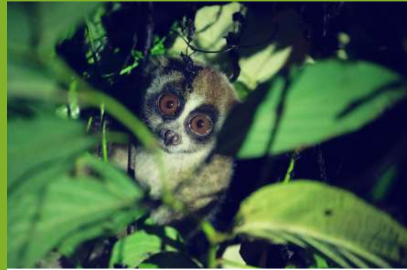
Slow loris population in Kuta Male is now stable and protected by the local community

👉 In conclusion: Intensive cooperation with farmers from the Kuta Male village was a significant focus, with the program actively involving local communities in wildlife protection efforts. Based on our experience, the presence of researchers working together with members of the local community, including former poachers, works well. These former hunters are perfect field assistants, whose employment allows for understanding of the situation in a particular place leading to the elimination of hunting. In addition to this, species' populations are supported by using farmland as a secondary habitat while ensuring species' protection through community involvement and education. Through education and awareness campaigns, the program encouraged sustainable practices while highlighting the importance of protecting wildlife habitats.