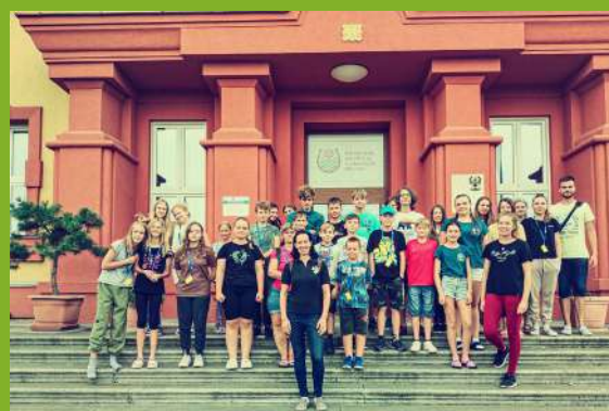
Lecture for the finalists of the competition for young breeders