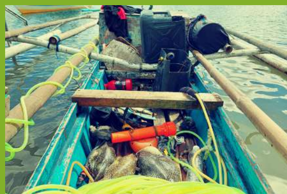
Seized ship with evidence material during raid on Bohol Island