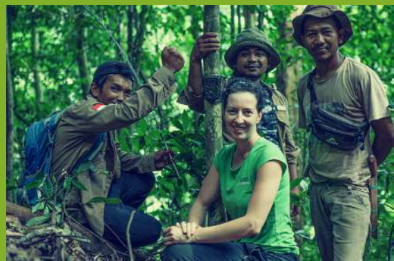
Field team during camera trap placement

👉 Development of Community Engagement in Nature Conservation: Kuta Male is one of our main examples of successful community engagement in conservation. We started operating in the Kuta Male area in 2016. At that time, slow lorises and other species of animals were still being hunted in the village mainly for the pet trade and the local wildlife population was decimated and thus slow lorises were hardly encountered in the area. At that time as well, however, we managed to eliminate hunting in this area by employing local poachers and we started noticing a more frequent occurrence of slow lorises. In 2018, we also founded the “Kukang Coffee Project” (transforming local farmers into conservationists by supporting eco-friendly coffee production). In 2019, we started regular monitoring using the trail method. Based on personal observations and some data collection, we are sure that the population of slow lorises in Kuta Male has increased significantly since 2016. The results of slow loris population abundance are slightly fluctuating but stable. Similar results also apply to other animals such as pangolins, whose protection is focused on by our sister program titled “Trenggiling Conservation Program”.