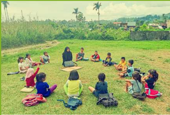
Outdoor teaching within E4C