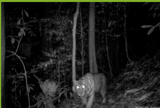
Sumatran tiger caught on a camera trap