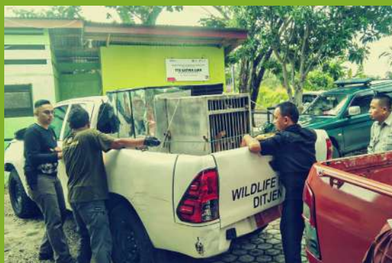
Transportation of confiscated gibbons to the Kalinda rescue center

The same team subsequently participated in the transfer of 6 confiscated agile gibbons from the quarantine of the Nature Conservation Agency of West Sumatra to the Sumatera Wildlife Center Kalinda rescue center in Lampung province. The move lasted three days and two nights, and during the transport, it was necessary to provide resting places and, of course, hydration and food for the exhausted animals. After rehabilitation, they will ideally be released back into the wild.