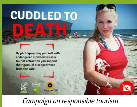
Campaign on responsible tourism