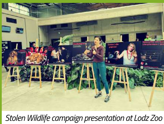
Stolen Wildlife campaign presentation at Lodz Zoo

Join us in spreading the word and taking action against wildlife trafficking too. Together, we can make a difference and safeguard the future of our wildlife.