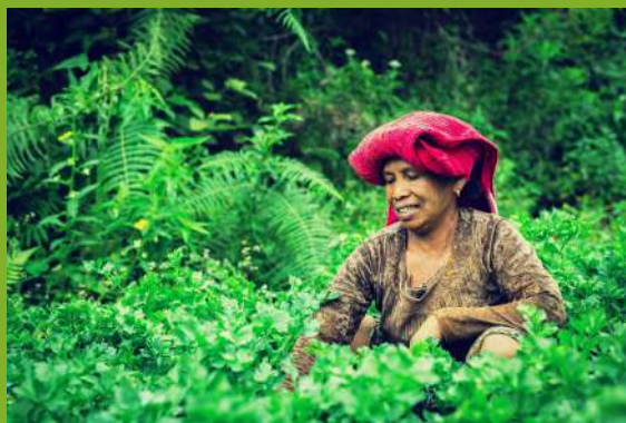
Farmer from the Kukang Coffee Community