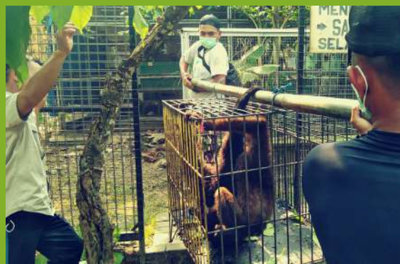
Gibbon handover at the Kalinda rescue center in Lampung Province

👉 Partnership with Vesna Panglao Conservation: The program extended its collaboration with Vesna Panglao Conservation from the Philippines to address illegal fishing in Bohol. This partnership led to joint efforts in catching fishermen using harmful methods, contributing to marine conservation efforts.