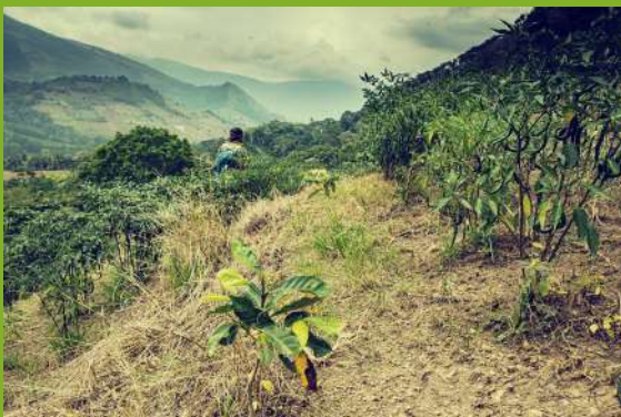
Farms on the edge of the protected Leuser Ecosystem

👉 In conclusion: Intensive cooperation with farmers from the Kuta Male village was a significant focus, with the program actively involving local communities in wildlife protection efforts. Based on our experience, the presence of researchers working together with members of the local community, including former poachers, works well. These former hunters are perfect field assistants, whose employment allows for understanding of the situation in a particular place leading to the elimination of hunting. In addition to this, species' populations are supported by using farmland as a secondary habitat while ensuring species' protection through community involvement and education. Through education and awareness campaigns, the program encouraged sustainable practices while highlighting the importance of protecting wildlife habitats.