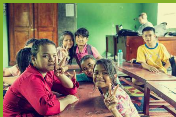
Children from Kukang School after class