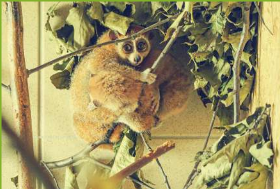
A female pygmy slow loris with young in the Ostrava Zoo