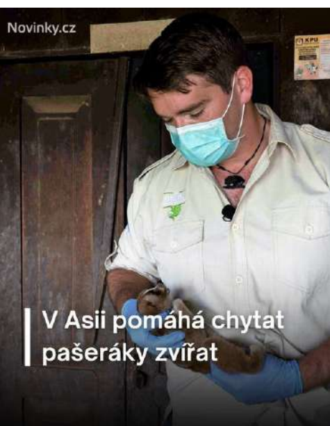
V Asii pomáhá chytat pašeráky zvířat

➤ Media Coverage and Interviews: The program received extensive coverage mainly in popular Czech news sites and magazines, as well as through podcasts and interviews, such as Aktuálně.cz, Novinky.cz, Právo, the "Ochrana přírody" magazine, TV Noe, Nature Solutionaries, etc. These media engagements helped to amplify the program's message and garner support for wildlife protection from a wider audience.