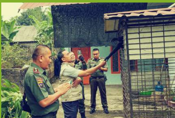
Seizure of siamang with Indonesian authorities