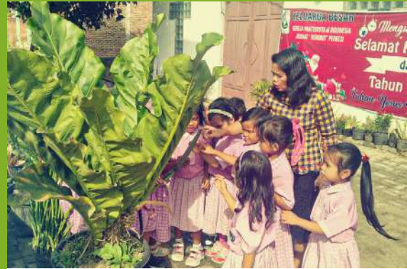
Teaching within E4C in Perbesi