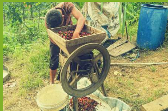
Local farmers living in harmony with endangered species