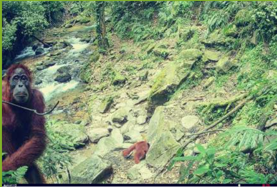
Sumatran orangutans on a camera trap