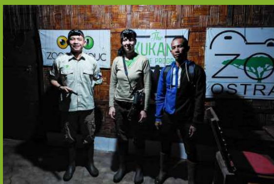
Monitoring team from Bandar Baru

👉 Monitoring of Nocturnal Animal Species: In the field area around the village of Kuta Male as well as near the village of Bandar Baru, where the Kukang Centre is located, regular monitoring of nocturnal animals took place using the transect method. In this way, the Kukang team determines the size of the population of slow lorises and other nocturnal animals, their behaviour and habitat requirements. In the Bandar Baru locality, the number of animal sightings has decreased, which is mainly attributed to hunting pressure in the area. Nevertheless, the team even managed to come across the Sunda pangolin ( Manis javanica ) twice. Once in the hills above 1000 m.a.s.l. and once right in a village near Bandar Baru. The pangolin found in the village was moved to a safe location in the forest further away. In the Kuta Male location, the number of recorded animals from the monitoring shows that the slow loris population is still stable here and slow lorises move without much fear even in the vicinity of populated areas. Even grown-up young have been recorded. The monitoring outcomes will result in a joint scientific article. Next to the wildlife and habitat surveys the team monitored the area for any poaching activity in the surroundings of Kuta Male, situated on the border of the Leuser Ecosystem.