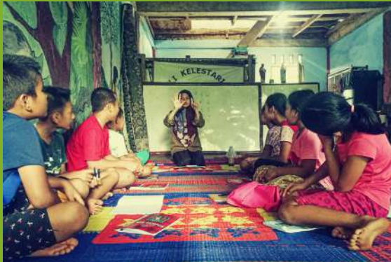
Teaching at the School at the End of the World

➤ Running “School at the End of the World”: In 2023, classes also took place regularly at this school, the construction of which we supported thanks to the grant from the Embassy of the Czech Republic in Indonesia in 2020. Thanks to the support of our program, a group of local children learn English and environmental education here every Saturday. They often lack this knowledge in public education, so they are happy to have this opportunity at the Tampuk Doni school (translated as “School at the End of the World”) in a remote village with lots of active children.