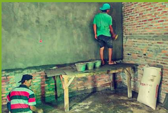
Wall repair at the Kukang Coffee House

In addition, thanks to the field team of conservationists, made up of former poachers, it is certain that the farmers are not hunting these animals, but rather protecting them. The success of Kukang Coffee not only supports livelihoods but also safeguards critical habitats near the Leuser National Park.