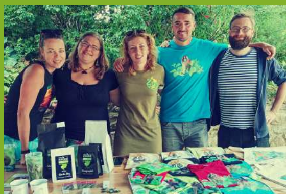
Screening of The Kukang Movie in Na Hrádečku Zoo