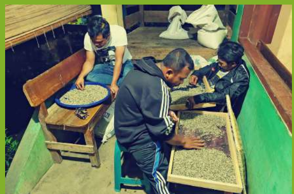
Hand sorting of Kukang Coffee

In 2023, our Kukang Coffee House in the Kuta Male village underwent a minor renovation so that we can still process coffee in the best possible conditions. The coffee house in this field area of the program was filled with coffee beans, which are diligently dried, dehusked and sorted by the Kukang team.