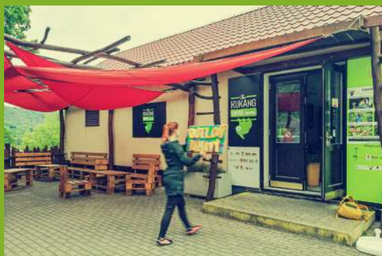
Kukang cafe in Zoo Ústí nad Labem which is one of the main partners of the Kukang Program