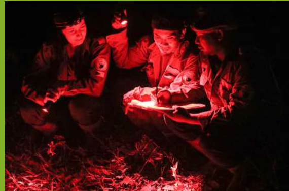
Recording data during monitoring in Kuta Male

➤ Camera Traps Project: In 2023, monitoring was supplemented with camera traps. Monitoring of wild animals is used to estimate their abundance. Camera traps are an additional monitoring method we use. These are installed by our field team in the field area where our program has been operating for a long time. In addition to being able to see from these records what animals move in the area and to track their behaviour, we can also see, for example, what animals share the same environment with slow lorises. Camera traps thus allow us to record otherwise very shy animals, which are especially active at night. In 2023, we worked alternately with 12 camera traps, which brought us many amazing shots from inside the Sumatran wilderness.