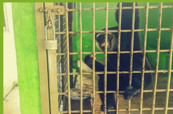
Seized agile gibbon