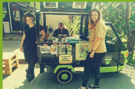
Kukang stand in Ústí nad Labem Zoo