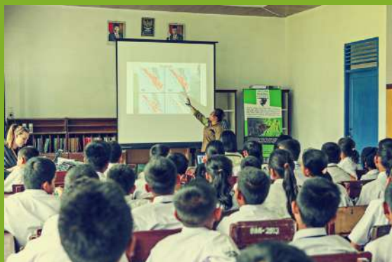
One of the lectures in an elementary school

➤ Lectures and Outreach: In 2023, we conducted 10 thematic lectures at state schools, enhancing 772 students’ knowledge of animal and nature protection. Through interactive sessions and engaging discussions, we empower youth to become ambassadors for wildlife conservation in their communities. Thanks to our questionnaires, it was verified that 75% of the students significantly improved their knowledge of animal and nature protection in the given topic thanks to the lecture.