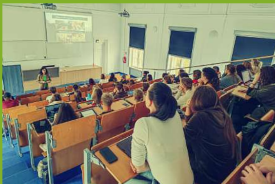
Lecture at the University of Veterinary Sciences Brno