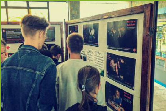
Stolen Wildlife at Zdíkov Primary School and Kindergarten