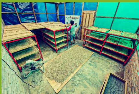
Coffee getting dried in the Coffee House