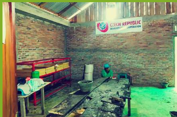
Renovation of the Coffee House

👉 Monitoring of Nocturnal Animal Species: In the field area around the village of Kuta Male as well as near the village of Bandar Baru, where the Kukang Centre is located, regular monitoring of nocturnal animals took place using the transect method. In this way, the Kukang team determines the size of the population of slow lorises and other nocturnal animals, their behaviour and habitat requirements. In the Bandar Baru locality, the number of animal sightings has decreased, which is mainly attributed to hunting pressure in the area. Nevertheless, the team even managed to come across the Sunda pangolin ( Manis javanica ) twice. Once in the hills above 1000 m.a.s.l. and once right in a village near Bandar Baru. The pangolin found in the village was moved to a safe location in the forest further away. In the Kuta Male location, the number of recorded animals from the monitoring shows that the slow loris population is still stable here and slow lorises move without much fear even in the vicinity of populated areas. Even grown-up young have been recorded. The monitoring outcomes will result in a joint scientific article. Next to the wildlife and habitat surveys the team monitored the area for any poaching activity in the surroundings of Kuta Male, situated on the border of the Leuser Ecosystem.