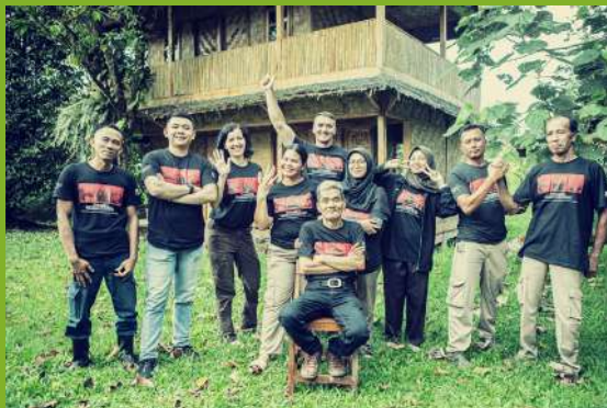
Part of the Kukang team at the Kukang Centre