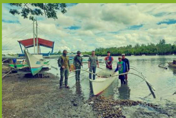
Arrested illegal fishermen with the Philippine Maritime Police from the Bohol Island

👉 Partnership with Vesna Panglao Conservation: The program extended its collaboration with Vesna Panglao Conservation from the Philippines to address illegal fishing in Bohol. This partnership led to joint efforts in catching fishermen using harmful methods, contributing to marine conservation efforts.