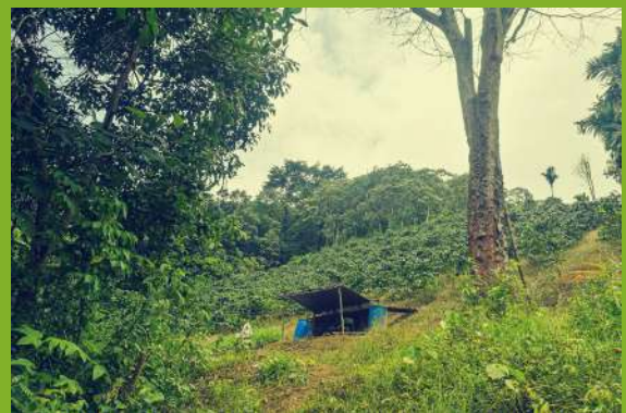
Farmers' coffee field in Amburidi