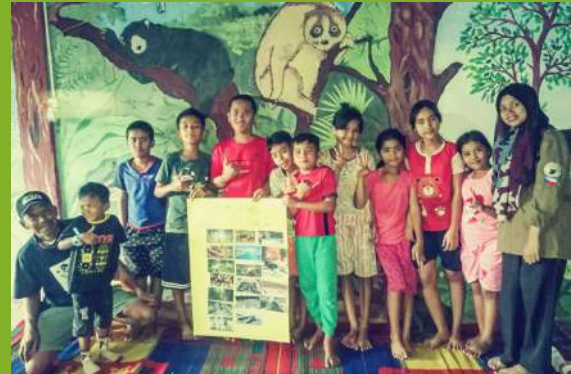
Lessons with children at the School at the End of the World

➤ Lectures and Outreach: In 2023, we conducted 10 thematic lectures at state schools, enhancing 772 students’ knowledge of animal and nature protection. Through interactive sessions and engaging discussions, we empower youth to become ambassadors for wildlife conservation in their communities. Thanks to our questionnaires, it was verified that 75% of the students significantly improved their knowledge of animal and nature protection in the given topic thanks to the lecture.