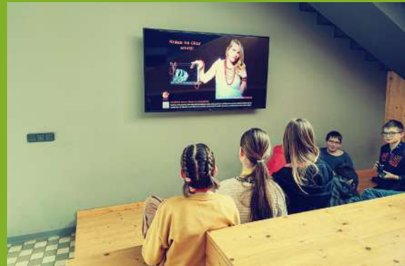
Stolen Wildlife at the Strakonice High School