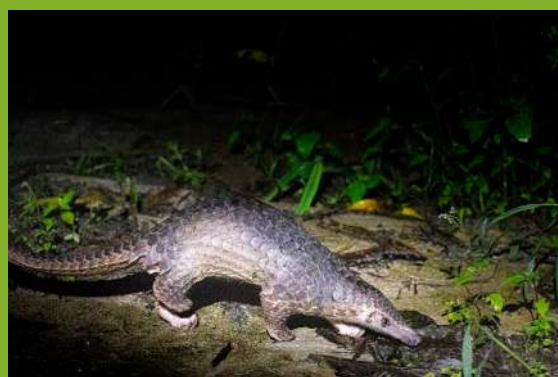
Critically endangered Sunda pangolin