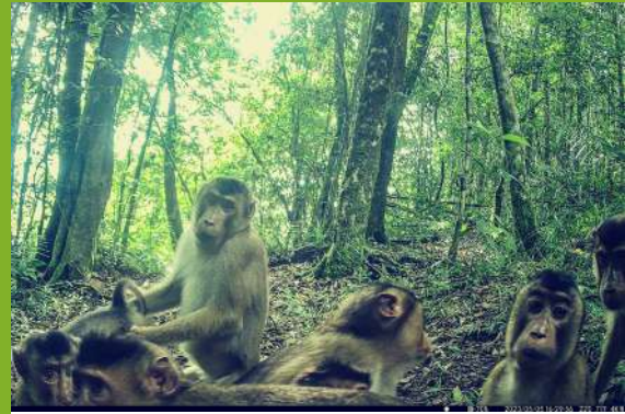
A family of pig-tailed macaque on a camera trap