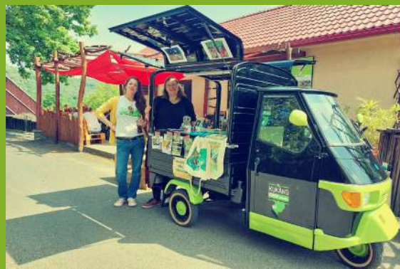
Kukang Coffee in Zoo Ústí nad Labem