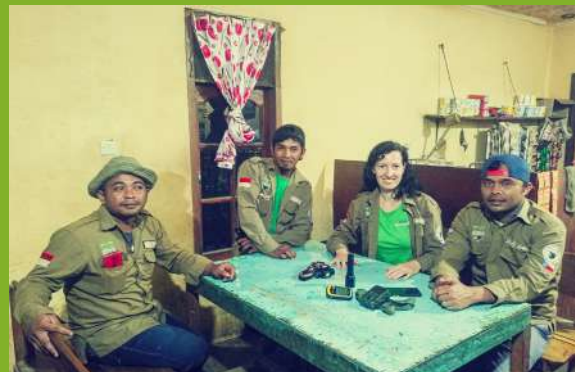
Part of the field Kukang team in Kuta Male