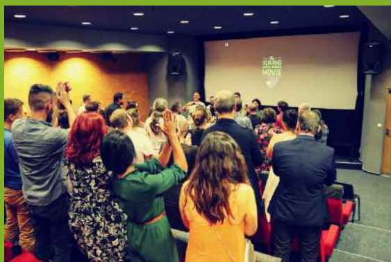
The ceremonial pre-premiere of The Kukang Movie at Minikino Ostrava

and achievements to a diverse audience. Kukang Movie was also part of the program of the Prague Science Film Fest on the campus of the Czech University of Life Sciences in Prague. The documentary, featuring conservationists and local communities, highlighted the challenges and successes of wildlife protection in Sumatra. Screening events called “Kukang Tour” took place across Czech partner zoos (Na Hrádečku Zoo, Ostrava Zoo, Olomouc Zoo, Hodonín Zoo and Liberec Zoo), coupled with discussions with actors and makers of the documentary and interactive activities including a stand with a workshop and games for children, as well as a tasting of national Indonesian food called “Nasi Goreng” and Kukang Coffee from Sumatra facilitated meaningful engagement with our cause.