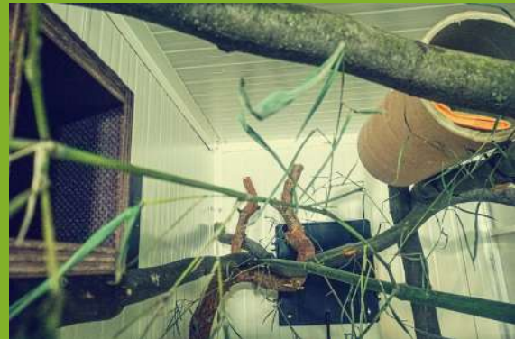
Enclosure for pygmy slow lorises in the Olomouc Zoo

The breeding of pygmy slow lorises is coordinated by the European Association of Zoos and Aquaria (EAZA) and we are trying to actively support it. In today's world, which is not very friendly to wild animals, it is extremely important to protect them not only in nature, so-called in situ, but also in human care, so-called ex situ. Unfortunately, we still cannot be sure that we and our colleagues will be able to sufficiently protect slow lorises in the wild. The situation in nature does not improve much, and in 2020 the species of pygmy slow loris was also reclassified from the "Vulnerable" category to the "Endangered" category. However, our back-up population in human care gives us some peace of mind. If we were to lose our fight to save slow lorises in the wild and they were even exterminated there, there is still hope in the form of the rescue breeding and Slow Loris Arks, from which we could then release selected individuals into the wild and restore their wild population.