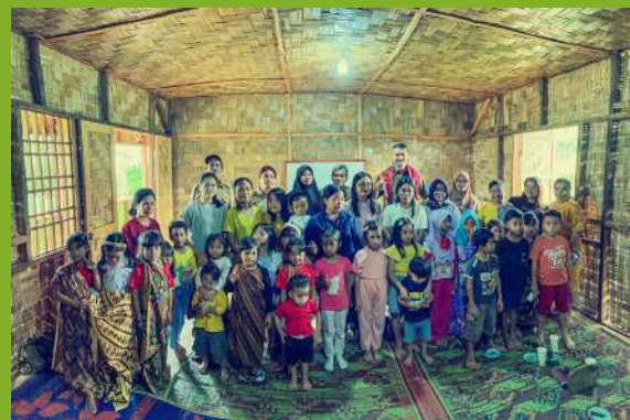
Children during the ceremony