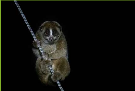
Slow loris observed during monitoring