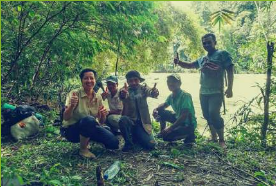
A team of former poachers - now conservationists - from the local community