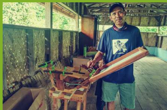
Manual T-shirt printing at the School at the End of the World