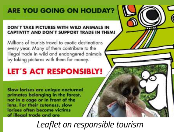
Leaflet on responsible tourism

👉 Stolen Wildlife Campaign: In 2023, other European zoos joined the Stolen Wildlife campaign. Specifically, these are the Polish Lodz Zoo and the Latvian Riga Zoo. Both zoos are now standing with us to raise awareness about the illegal wildlife trade. Together, we're shedding light on the harsh realities of this illicit industry and advocating for the protection of precious animals.