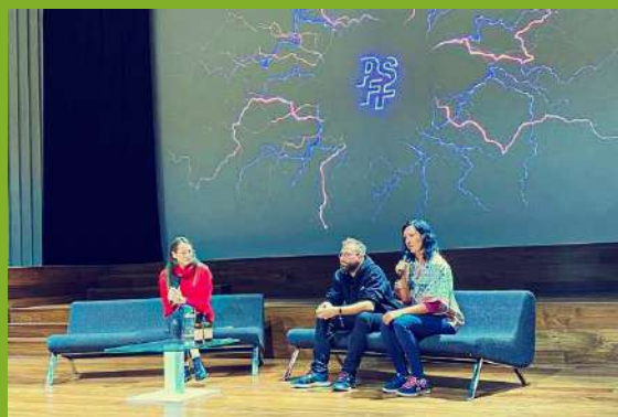
Screening of The Kukang Movie at the Prague Science Film Fest