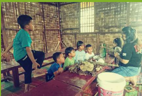
Education4Conservation lesson at Kukang School