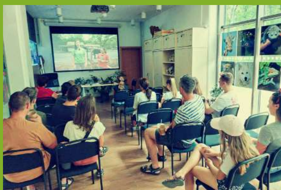
Screening of The Kukang Movie in Olomouc Zoo