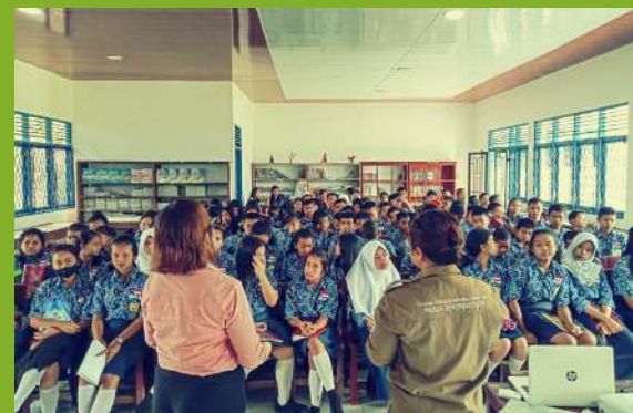
Evaluation of students after the lecture

Our involvement in the Education4Conservation (E4C) program, which aims to enrich the learning of preschoolers through outdoor activities, continued as well. This teaching takes place in the “Kukang School” as well as in two other schools, one in the village of Amburidi and the second one in the village of Perbesi located close the Kuta Male village.