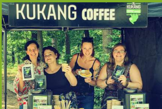
Kukang Coffee in Olomouc Zoo

30 March – talk at One World Olomouc Fest 10 May – opening of the exhibition "Faces of CITES" at the Prague Zoo 7 September – Taste the Story with Endorfin Republic – Prague 29 November – Fair of Nature Conservation Agency