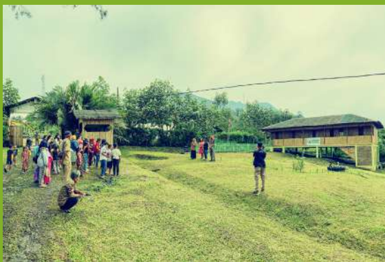
Inauguration of the new building of Kukang School