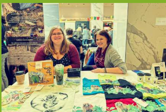
Kukang stand at the Around the World travel festival