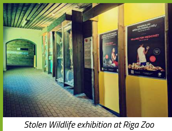
Stolen Wildlife exhibition at Riga Zoo